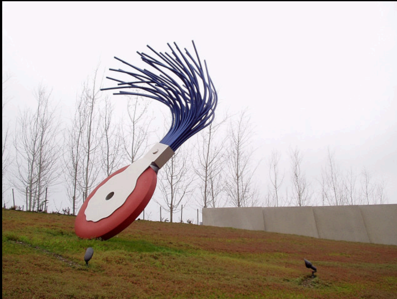
Typewriter Eraser, Scale X , by Claes Oldenburg and Coosje van Bruggen 1999, painted stainless steel and Fiberglas National Gallery of Art, Washington, DC